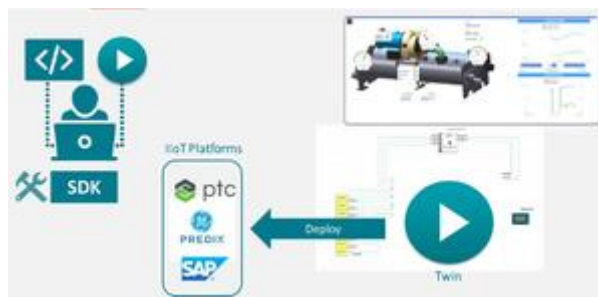
Integration of digital twins in IIoT platforms using the TwinBuilder Runtime SDK